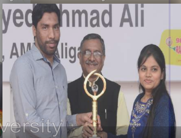
Fiesta, Integral University