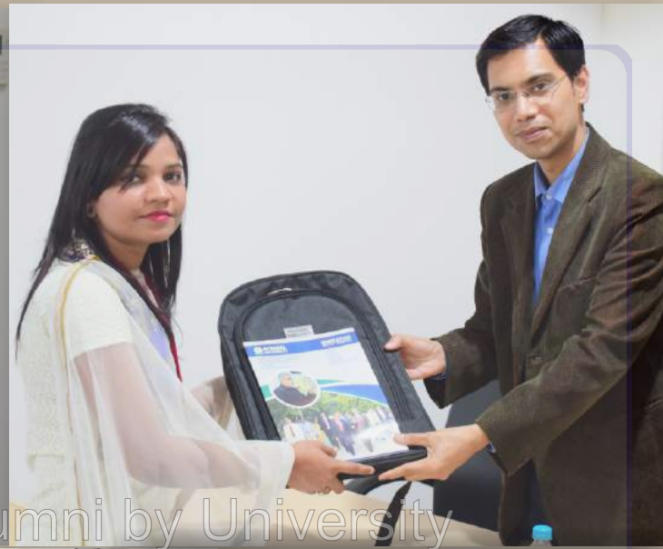
Felicitation of Alumni by University